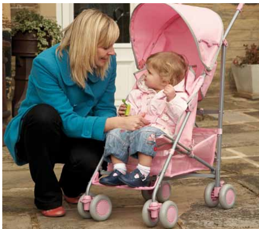
Encouraging parents to try walking with a buggy