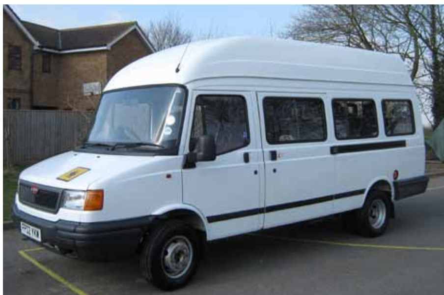
Hagbourne School minibus

We don't usually advertise vehicles for sale, but it has come to our attention that Hagbourne School currently have a seventeen seat 02 plate minibus looking for a new home. It has 52,000 miles on the clock and has been regularly serviced by Enterprise four times