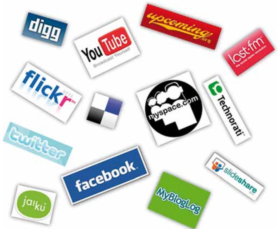
Some types of social online media

But a website can't do what we want on its own. With JACKfm and FM107.9, we are exploring a variety of new ways of encouraging students, parents and schools to talk about travel and try out walking or cycling. You should start to notice something different this summer!