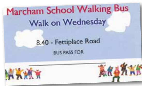
Marcham School walking bus pass

Marcham Primary School now has over 83% of its pupils walking to school! So, what's their secret...?